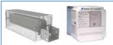
Resistors and braking transistors