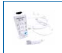
Parameter Copy Unit