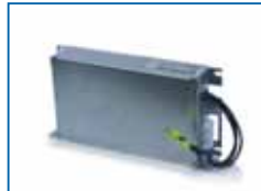
EMC line filters (foot-/sidemount)